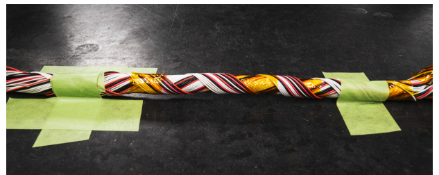
The wiring harness has been designed, cut, and twisted. Thanks to BMRS Wired for sponsoring material, and Rapid Harness for design software!