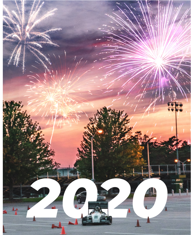
Our New Year's Day photo!

If you're not following our Instagram yet, be sure to head over to instagram.com/msuformularacing so you don't miss the latest team updates and photos! With manufacturing season in full swing, we can't wait to show you parts of our car as they roll out of the machine shop!