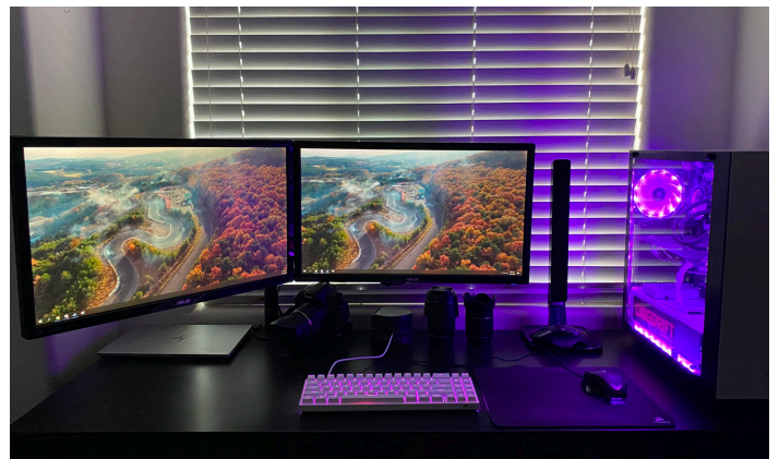
John Burroughs has a very clean and modern workstation – perfect for running CFD (and iRacing!)