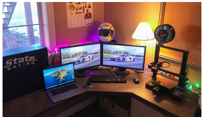
Everything that Dave Yonkers needs is only an arm's length away!