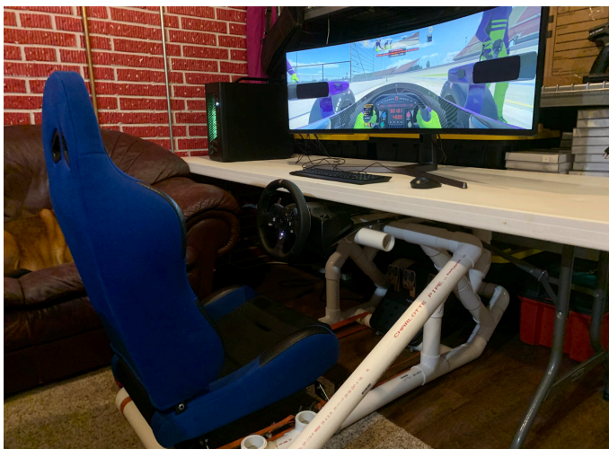
Ty Ebling has an iRacing setup that's sure to keep his driving skills in tip-top shape while still being able to practice social distancing.

Unprecedented times call for unprecedented member features, and this is certainly no exception. Along with the growing trend of showcasing home-offices, the team figured it would be neat to feature interesting productivity stations that are helping our team stay remotely connected.