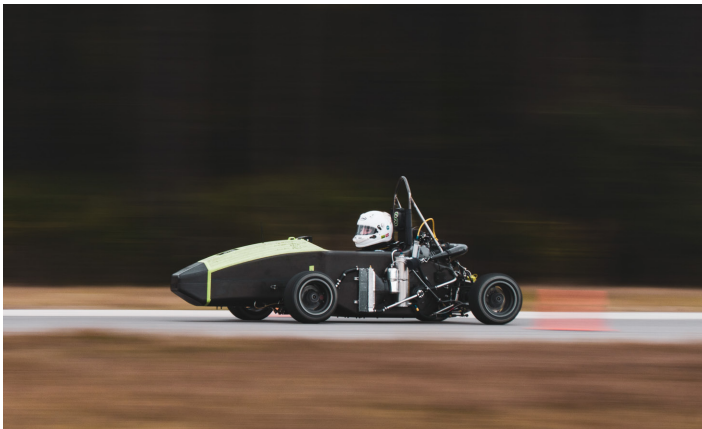
What would have been this year's challenger, SR-20, driving during our first official testing session back in February.

We are extremely grateful to have 3M as a sponsor of our team, as their PPE keeps us safe while building and servicing our vehicles. Not only do they donate PPE, but without their epoxies, tapes, sandpapers, and adhesives (just to name a few), we would not be able to bring our cutting-edge designs into reality. While we had hoped to do the same this year, it was obvious that our N95 respirators and other PPE would be better used protecting the lives of local healthcare workers on the front lines of COVID-19. We are more than happy to help the stop of the pandemic in any way possible, and we admire those who are saving lives across the country.