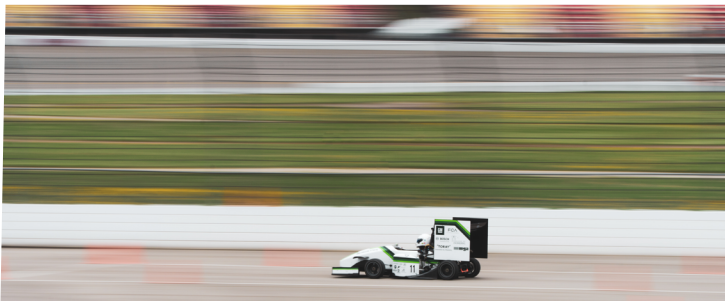
FSAE Michigan Endurance, 2019

The actual driving events start on Friday with acceleration, skidpad, and autocross. The fastest autocross time determines where the team will start the endurance event on Saturday—later in the day is better.