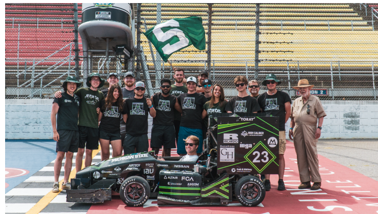
A team full of happy engineers!

After both the virtual knowledge event scores and dynamic event scores were added up, the team came home with fourth place overall!