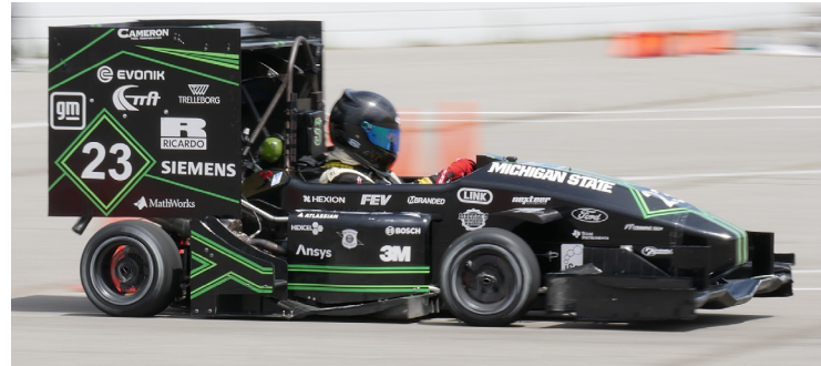
Jimmy Provox putting down fast laps on the MIS back straight

Endurance day is often the most stressful day of competition. For those who are unfamiliar, rarely half of the cars that start the race even make it to the finish. With two endurance failures in 2019, the team was on edge heading into the fourth day of competition. A middle-of-the-pack placement allowed the team to prep the car in the paddock while the first handful of teams were out on track.