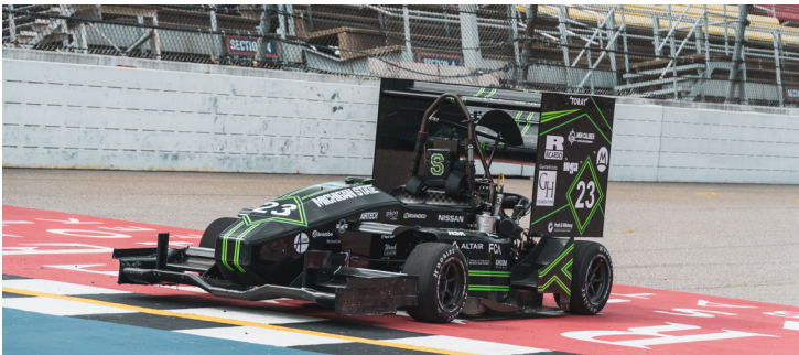
SR-20, lined up on MIS' finish line after an impressive performance

The team traveled to Michigan International Speedway on July 7th for the first FSAE Michigan competition since the summer of 2019. After sleepless nights, the typical spit of poor weather, and, of course, the last-minute scramble to fix broken parts, SR-20 was loaded up and sent to Brooklyn, MI.